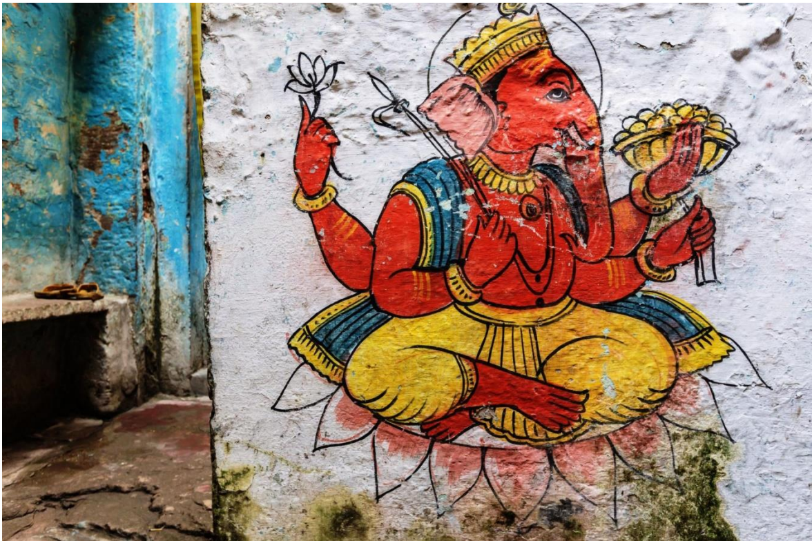
Ganeśa is the elephant-headed God of Wisdom, the son of Śiva. He is the same as the Egyptian Thoth-Hermes, and Anubis or Hermanubis. The legend shows him as having lost his human head, which was replaced by that of an elephant. 2

Hermes Trismegistus ( Gr. ) [is] the “thrice great Hermes,” the Egyptian. The mythical personage after whom the Hermetic philosophy was named. In Egypt the God Thoth or Thot. A generic name of many ancient Greek writers on philosophy and Alchemy. Hermes Trismegistus is the name of Hermes or Thoth in his human aspect, as a god he is far more than this. As Hermes-Thoth-Aah , he is Thoth, the moon, i.e. , his symbol is the bright side of the moon, supposed to contain the essence of creative Wisdom, “the elixir of Hermes.” As such he is associated with the Cynocephalus, the dog-headed monkey, for the same reason as was Anubis, one of the aspects of Thoth. The same idea underlies the form of the Hindu God of Wisdom, the elephant-headed Ganeśa, or Ganpat [see illustration below], the son of Pārvatī and Siva. When he has the head of an ibis , he is the sacred scribe of the gods; but even then he wears the crown atef and the lunar disk. He is the most mysterious of gods. As a serpent, Hermes Thoth is the divine creative Wisdom. The Church Fathers speak at length of Thoth-Hermes. 1