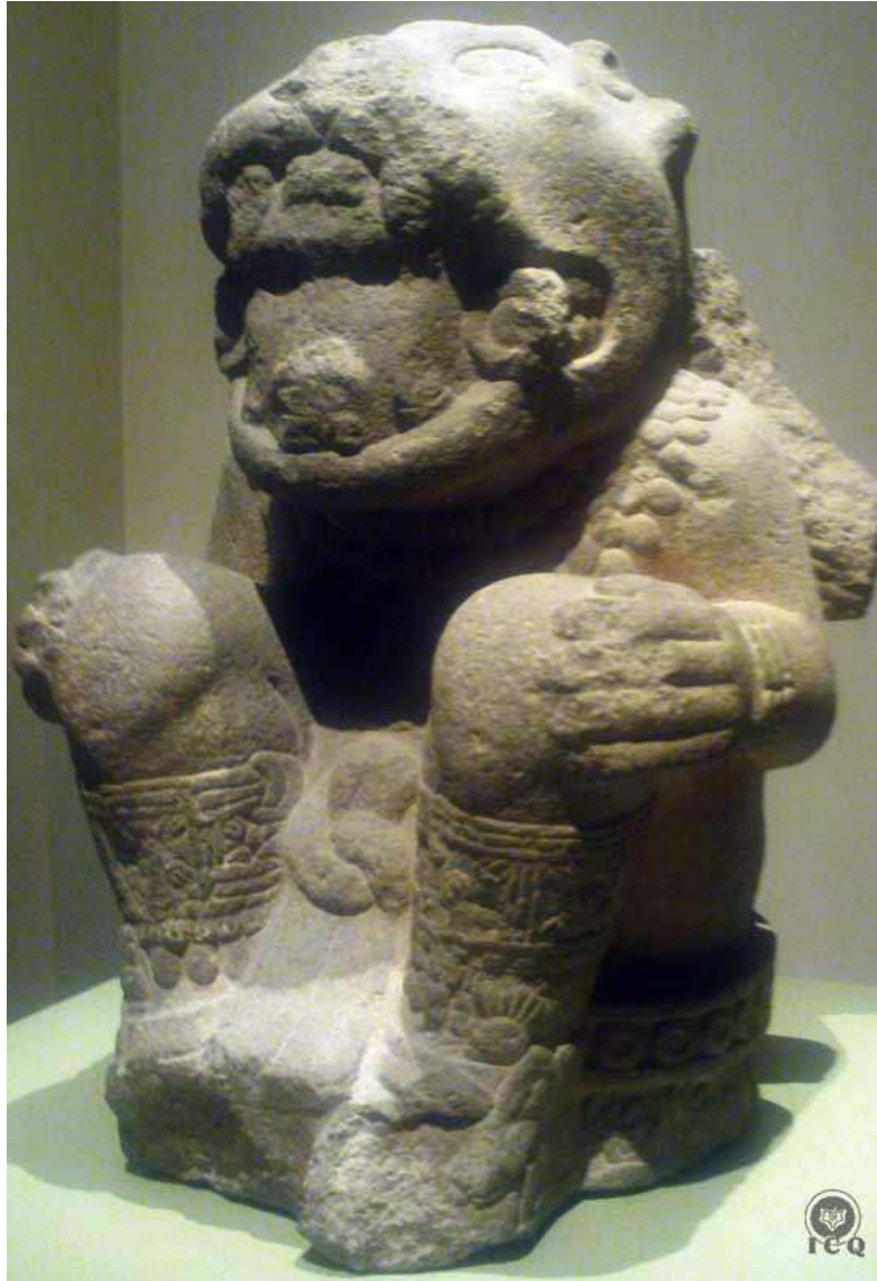
Figure 33 - Tiger-Knight Warrior (Museum of History and Anthropology, Mexico)