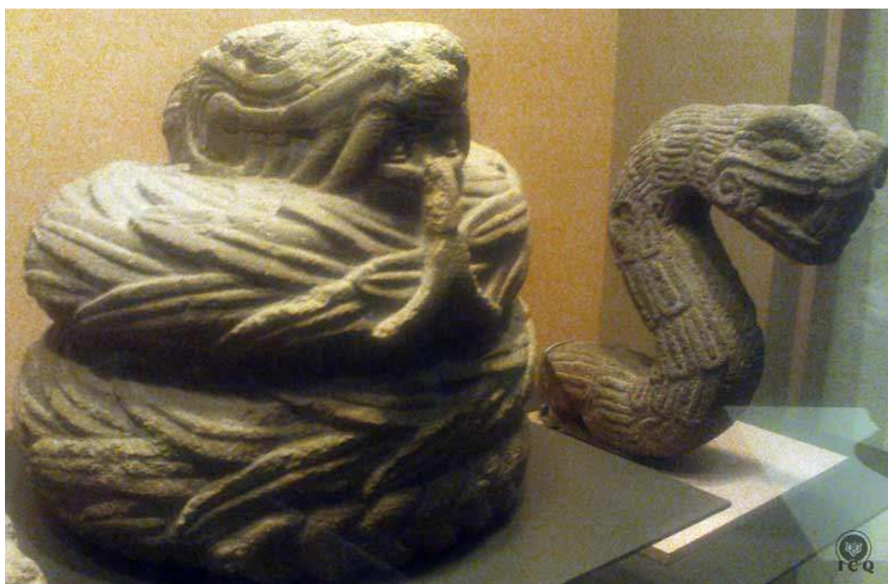
Figure 15 - Feathered Serpents (Museum of History and Anthropology, Mexico)

But when the seeker of the path works simultaneously in their “Hill of the Serpent” [Coatepec] alluding to the other two factors that enable the revolution of the consciousness, he then works with superior forces. On one hand the serpent is a symbol of the electric power of love that can be wisely transmuted when we, instead of approaching our spouse with animal passion, sincerely love them and seek the channeling of the creative forces that flow at the time of the connection of the man and the woman. In Gnostic wisdom this work is known as BIRTH .