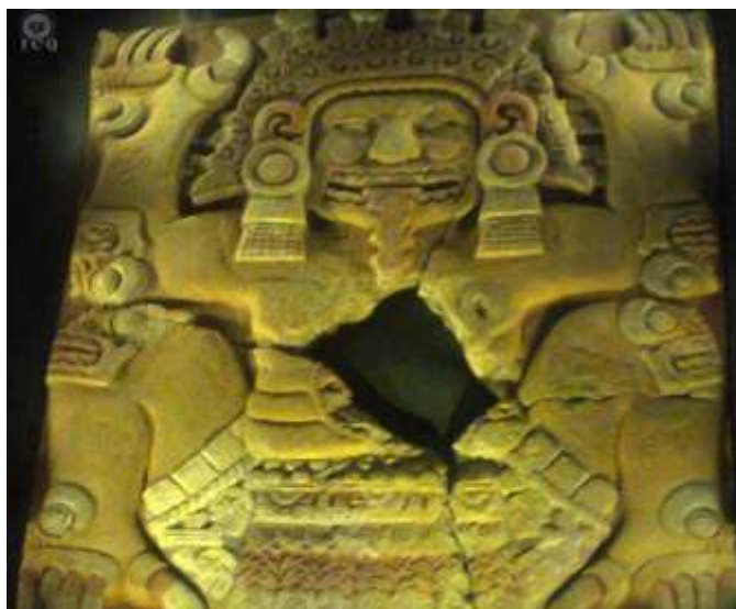
Figure 34 - Mother of the Earth. Origin of all that has been, is and will be. (Museum of the Major Temple, Mexico)

The Inner Christ, Huitzilopochtli, is a fragment, a spark that emanates from the Universal Fire.