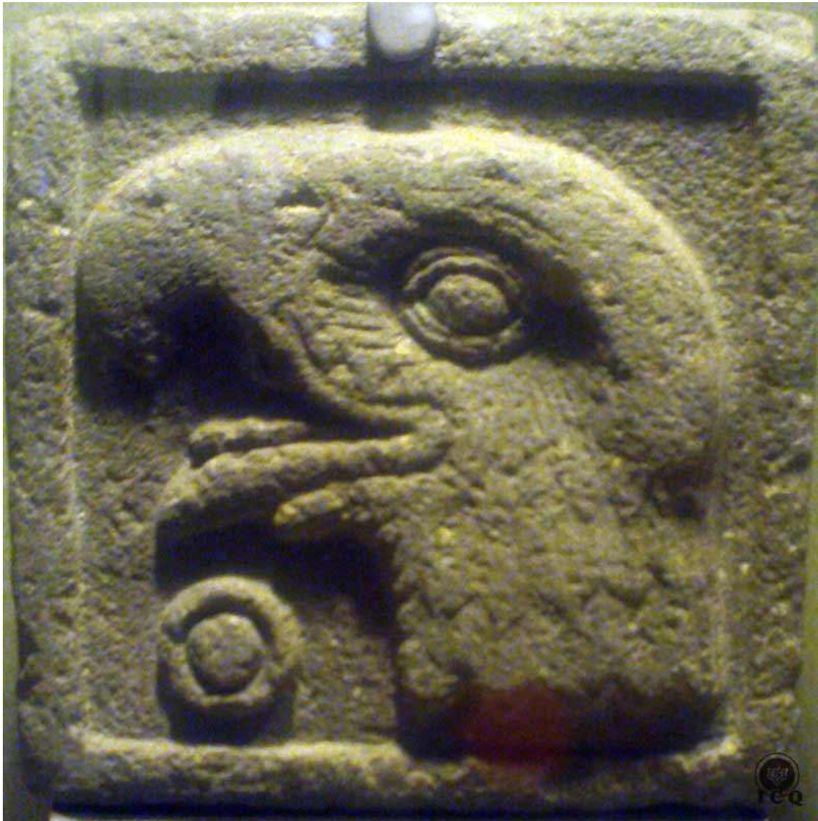
Figure 24 - (Number) One-Eagle. (Museum of History and Anthropology, Mexico)