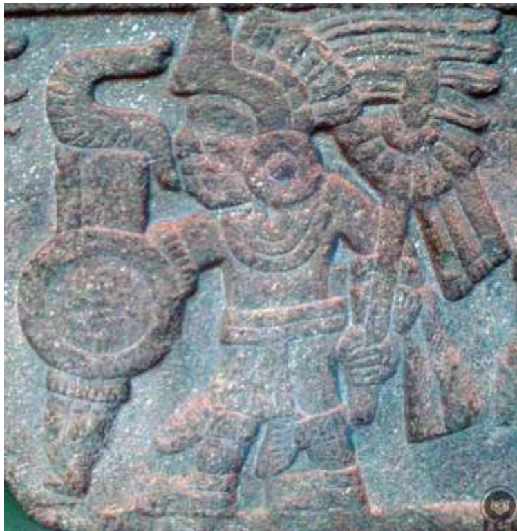
Figure 21 - A warrior. (Museum of History and Anthropology, Mexico)

We live in the midst of all of this, without ever thinking not even for an instant, these events are taking place; we are victims of our own creations and much worse, we do not even understand the complexity of the chaos we have created.