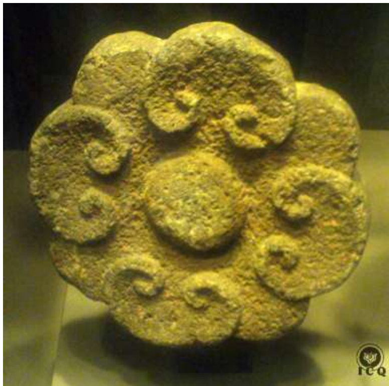
Figure 32 - A flower, symbol of the Essence (Museum of History and Anthropology, Mexico)

The work on the death of the ego must be consistent and persistent, it is not meant to be superficial work or an effort expected to take a few months or perhaps a few years. This is an initiative that takes life itself and we must never become complacent.