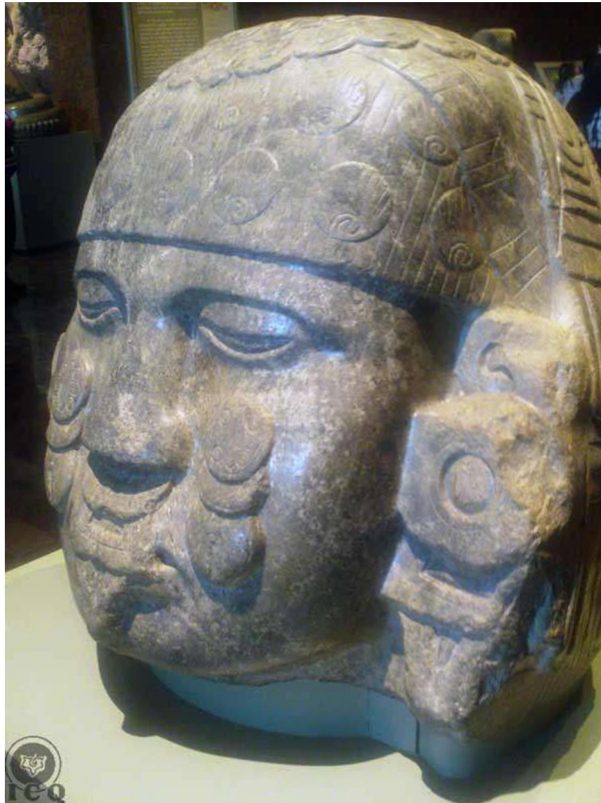
Figure 13 - "The One Adorned with Rattles" [Coyolxauhqui] (Museum of History and Anthropology, Mexico)

All symbols carry particular meanings, according to the subject matter in question. This is why the teaching can never be interpreted literally with the use of the intellect. It becomes imperative to make use of more superior faculties, as is intuition, so that we can understand these mysteries with the faculties of the heart.