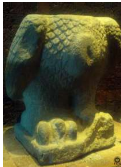
Figure 31 - A decapitated eagle, symbol of the Death of the Ego. This particular symbol shows the need to stop the incorrect use of the mind. (Museum of History and Anthropology, Mexico)

And this is why we see all over the world “death” as a symbol in the foundation of any work relevant to spiritual advancement; whether it is a throne carved as a skull, or monks like St. Francis of Assisi with a skull on his table, or walls in sacred temples showing carvings of skulls. It is all an invitation to embrace psychological death.