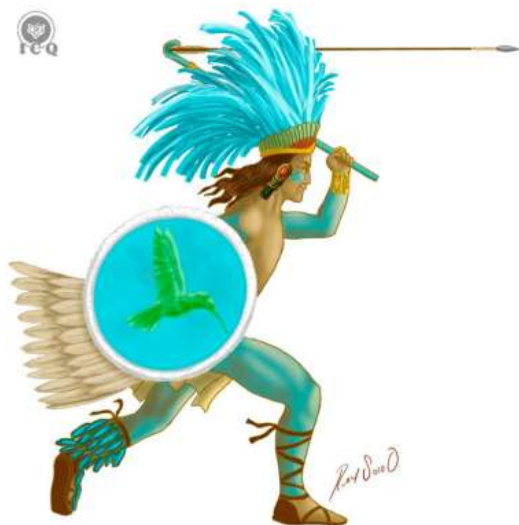
Figure 7 - Huitzilopochtli, tossing spears.

“Tossing spears with his left hand” invites the use of the faculty of creative comprehension, the type used when we strive to truly understand a psychological aggregate so it can be eliminated. If we for example we suppress our anger, we are effectively empowering it; and if we set it free, then it grows in geometric proportions. It is only through the effort of creative comprehension how we make ourselves able of having the complete understanding of a defect that will allow us to eradicate it from within.