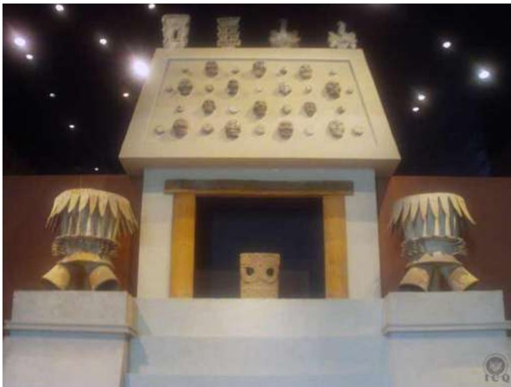
Figure 35 - Adoration site with braziers (Museum of History and Anthropology, Mexico)