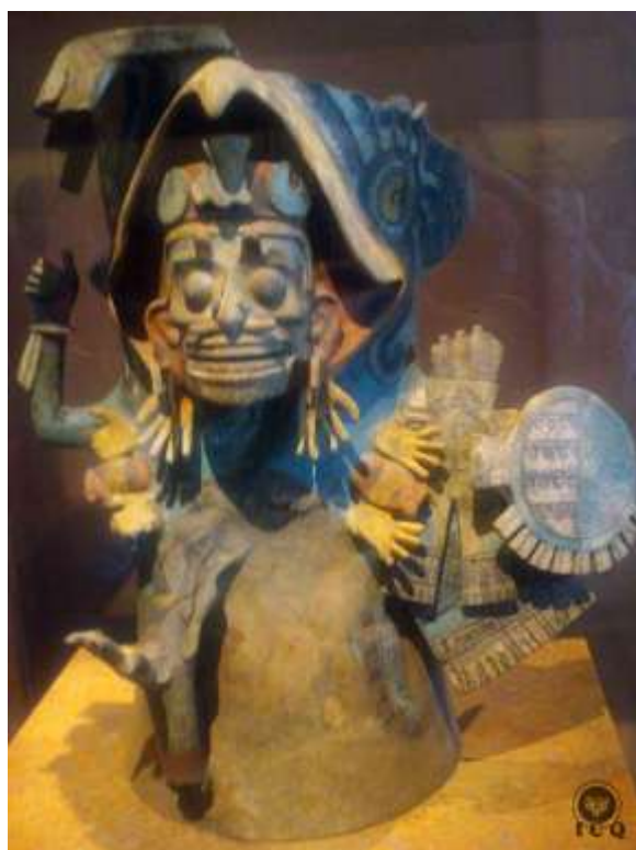
Figure 9 - Brazier of the Dead Warrior (Museum of History and Anthropology, Mexico)

To fall dead before agaves (magueys) and cacti is a symbol similar to the crown of thorns worn by the Master Jesus, as well as for the Cloth of Veronica; these speak are to the amount of THELEMA 4 (willpower) that is necessary to achieve this work. This is not something anyone can make happen; this is not for those who are inconsistent, superficial, or those who are skittish or fickle. We need of the discomforting motivation that comes sharp tip of the thorn to invite the work and the internal battle.