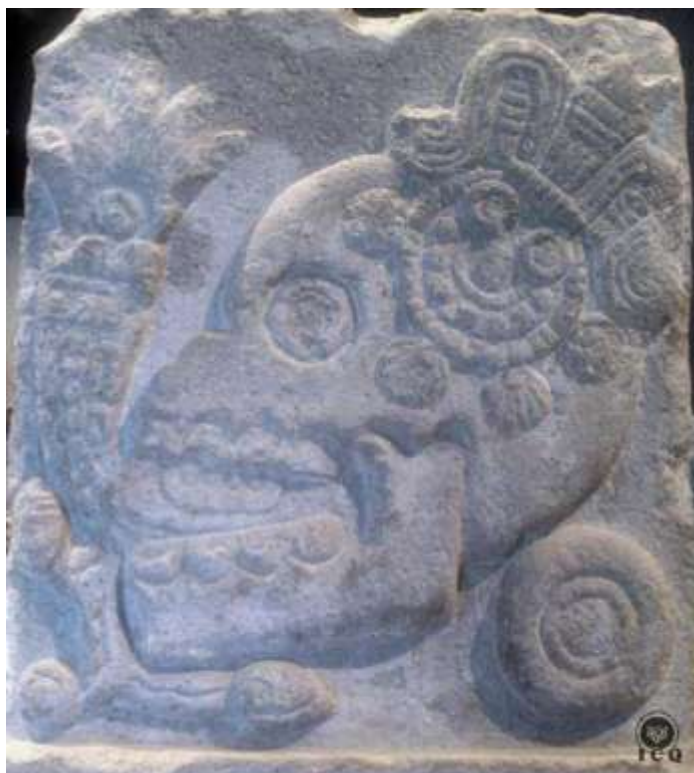
Figure 30 - Cranium, symbol of the death that takes place in battle and out of its mouth, a symbol of burnt water. (Museum of History and Anthropology, Mexico)

"Heracles (the Cosmic Christ), the son of Jupiter (IO Patar) and Alcmene, performed the Twelve Labors: