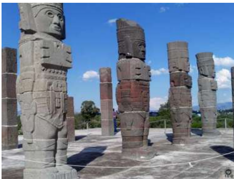
Figure 11 - "The Land of Tules" [Tollan or Tula]. Hidalgo, Mexico

“Tula” relates to the mysteries of the path of internal purification, to reaching the threshold of the “Garden of Eden” or all that is eternal and divine.