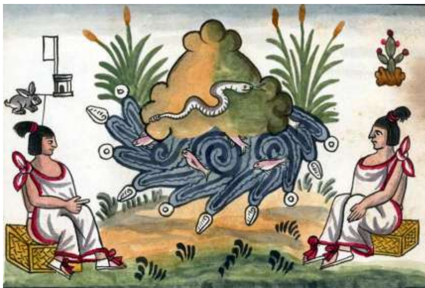
Figure 10 - "The Hill of the Serpent" [Coatepec] (Tovar Codex)

This narration takes place – or perhaps should take place – in the “Hill of the Serpent” [Coatepec] that exists deep within our own selves.