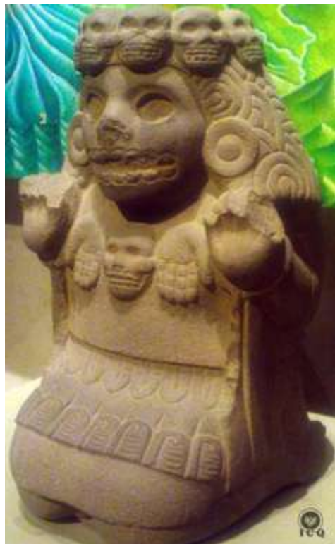
Figure 29 - The Goddess of War [Cihuateotl] (Museum of History and Anthropology, Mexico)

These spirits are the masters of the White Brotherhood that we may as well refer to as Angels; they diligently aid those who work intensely upon themselves in a sincere effort to reach an internal revolution.