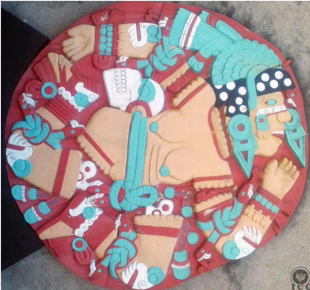
Figure 28 - "The one adorned with handbells" [Coyolxāuhqui] tumbling down the hillside of the "Mountain of the Serpent" [Coatepec] (Museum of History and Anthropology, Mexico)

Once this is achieved, the sincere practitioner who seeks self-knowledge can then direct their sacred fire against the various elements that make up our animal passions and decapitate them. Doing so will result in the fatal end of our individual Coyolxāuhqui: dismembered, she will tumble down the hillside of our "Mountain of the Serpent" [Coatepec].