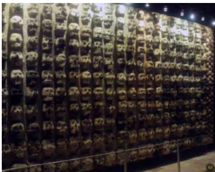
Figure 22 - The Wall of Heads [Tzompantitlan] (Museum of the Major Temple, Mexico)

The Four-Hundred Southerners had already reached the heights of the place known as “the rows of heads” [Tzompantitlan]. This is the place where the craniums of enemies defeated in previous battles were set on stakes and arranged in rows.