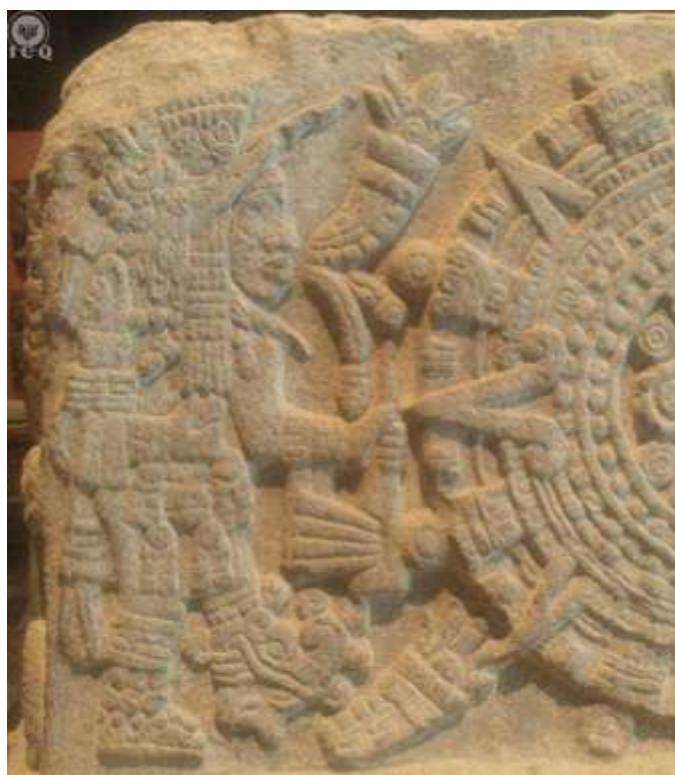
Figure 3 - "the Left-Handed Hummingbird" [Huitzilopochtli]. Detail from the Stone of the Temple [Teocalli] (Museum of History and Anthropology, Mexico)

To grasp the meaning of these words, we must first know who the Mexica are. They are known as the founders of Mexico-Tenochtitlan and without a doubt, there is a hidden meaning we must comprehend.