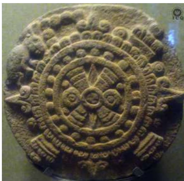
Figure 6 - Solar Disc (Museum of History and Anthropology, Mexico)

Such marvelous energy has its exponent in a very part of our Being: The Intimate Christ. Ancient axioms state that we must not look outside of us that which we have within; its main attribute is love, as the sun illuminates all that exists, with no distinctions of any kind.