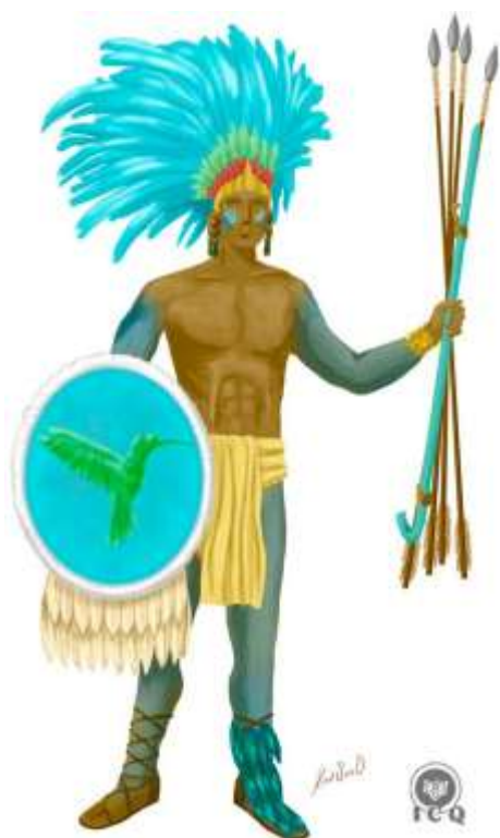
Figure 25 - "Left-Handed Hummingbird" [Huitzilopochtli]

It should be of no surprise to see the birthdate of the “Left-Handed Hummingbird” [Huitzilopochtli] to take place, according to the chronology of the Mexica, the last day of the fifteenth month of the Nahuatl calendar (the “day of the rising of the flags” [panquetzaliztli]), which corresponds to December 19.