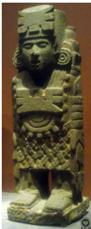
Figure 17 - Atlantean-Aztec Warrior (Museum of History and Anthropology, Mexico)

The moment someone attempts to start the awakening of their internal faculties is the moment the Ego multiplies its power to keep us in the deepest sleep of the consciousness.