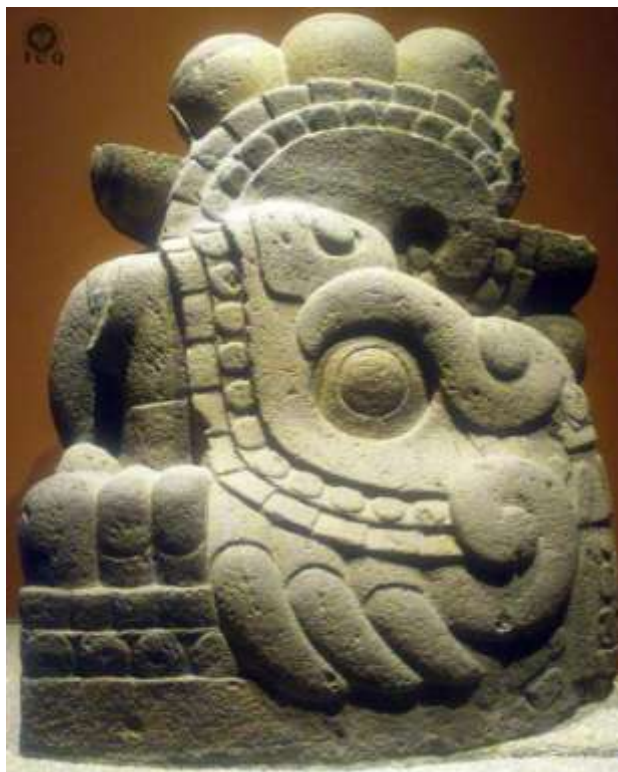
Figure 26 - "Serpent of Fire" [Xihcoatl] (Museum of History and Anthropology, Mexico)

From the most ancient times all of the great cultures of the world have worshipped fire, but it must be noted that the worship is not to be taken literally as a worship to the fire that can be used to prepare a meal, or perhaps to the fire that comes with lightning but rather, the fire that exists in potentiality, in a latent state within our occult anatomy.