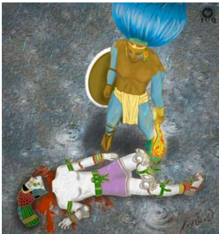
Figure 27 - Huitzilopochtli defeats Coyolxauhqui, "the one adorned with handbells"