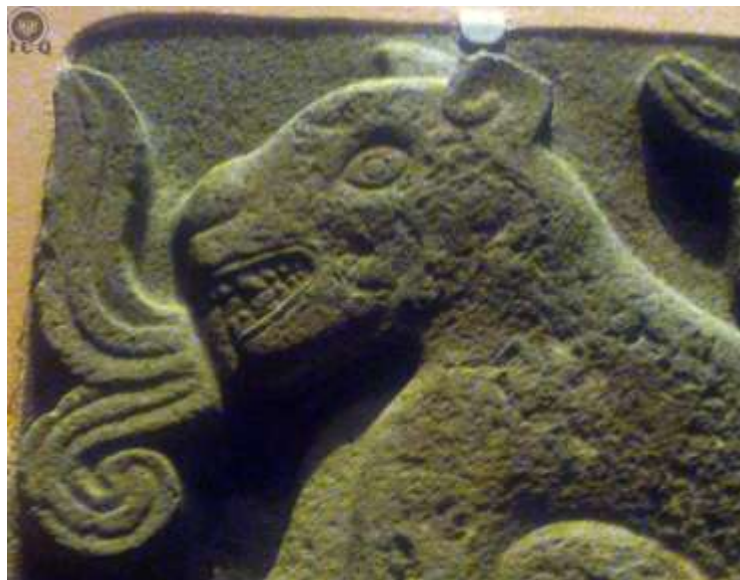
Figure 18 - a Jaguar with a glyph of the word emerging from its mouth. The Jaguar is the Innermost and the glyph, the "Voice of the Silence". (Museum of History and Anthropology, Mexico)

In their efforts to make contact with our human personality, they rely on hunches; Immanuel Kant called those “intuits” and the Helena Petrovna Blavatsky referred to it as “the Voice of the Silence”.