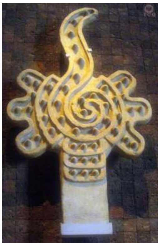
Figure 1 - ALMENA CARACOL. Cross-sectional rendition of a seashell; symbol of Venus, the Morning Star and symbol of love. (Museum of History and Anthropology, Mexico)

When we long with all of the strength of our soul to discover the way that can take us to the experience of the Truth, we tend to find paths that are complex, akin to the labyrinths of times long past when the aspirant sought the way; the difference today being such complex paths are made up of numerous contradictory theories.