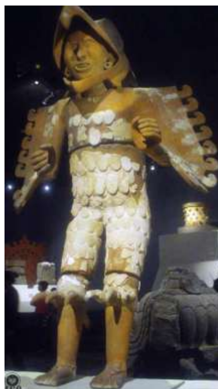
Figure 20 - An Eagle-Knight (Museum of the Major Temple, Mexico)