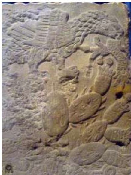
Figure 5 - The Foundation of Mexico. Detail from the Stone of the Temple [Teocalli] (Museum of History and Anthropology, Mexico)

Being “the navel of the moon” or Mexica, suggests that we must be comprehensive, that we must have as our foundation the love for humanity, that we must learn to place ourselves on the footsteps of