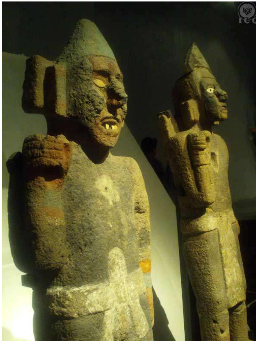
Figure 16 - Warriors (Museum of History and Anthropology, Mexico)