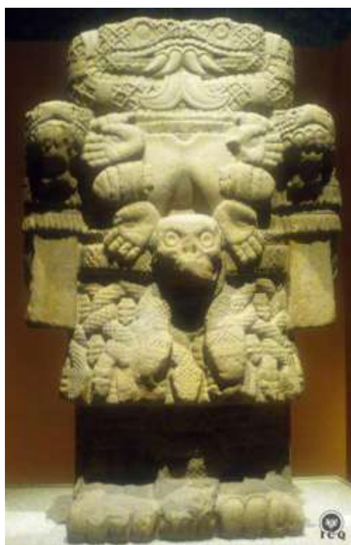
Figure 14 - "The One with the Skirt of Serpents" [Coatlicue] (Museum of History and Anthropology, Mexico)

“The One with the Skirt of Serpents” [Coatlicue], our individual and particular Divine Mother was making penance in the Hill of the Serpents [Coatepec]; she was walking the path of initiation, sweeping her internal impurities which is how penance is done.