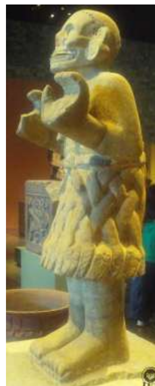
Figure 12 - "The One with the Skirt of Serpents" [Coatlicue] (Museum of History and Anthropology, Mexico)