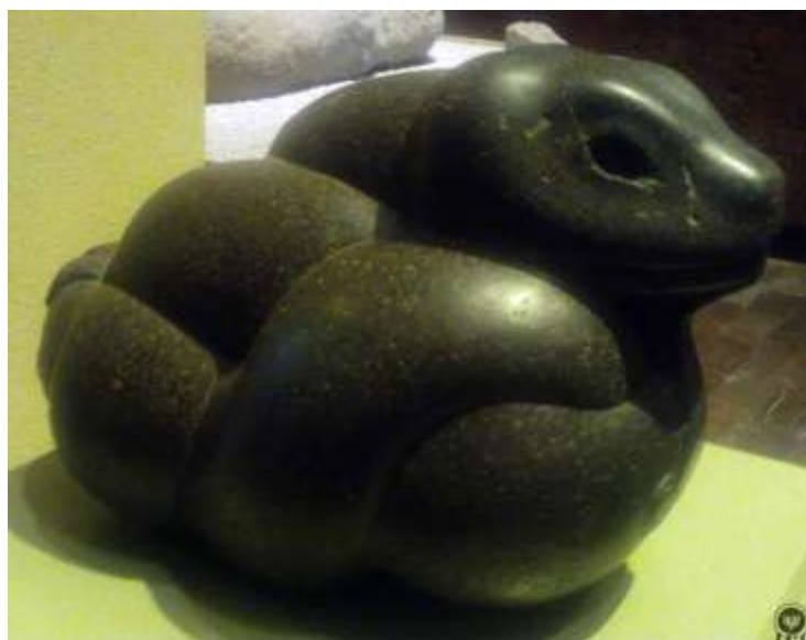
Figure 23 - Knotted Serpent. (Museum of History and Anthropology, Mexico)

It becomes of vital importance for us to know “where are they coming from” so we can comprehend our aggregates as they manifest through our habits, our intellect, our emotions, our instinct, and our sexuality. As we observe ourselves, we can find out that a naïve friendship with someone from the opposite sex could manifest as a beautiful ideal in the mind, as love in our emotions, and with certain morbidity in our sexuality. In many instances we even experience adultery within the mind and all of this, without noticing.