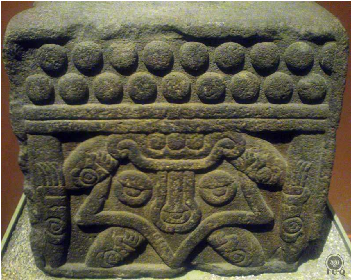
Figure 37 - Chest of Stone [Tepetlacali] dedicated to Venus. Fraternal love is represented by Venus. (Museum of History and Anthropology, Mexico)

Seek of the Left-Handed Hummingbird within your internal universe, feeling all those around you as if they were you and you were them; loving and helping all of humanity, and you will achieve the great event of receiving him and experiencing his birth within your heart.