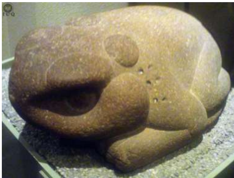
Figure 4 - Frog (Museum of History and Anthropology, Mexico)

There are other places on Earth where we find esoteric definitions that are similar to this one, as in Cuzco, Peru because Cuzco means “the navel of the world”. No one can deny these are very special localities charged with magnetism, spiritualism, and they are filled with magic; it is obvious such names point to something that is inherently profound, and their ancestral authors make an effort to deliver a message that we must make an effort to comprehend.