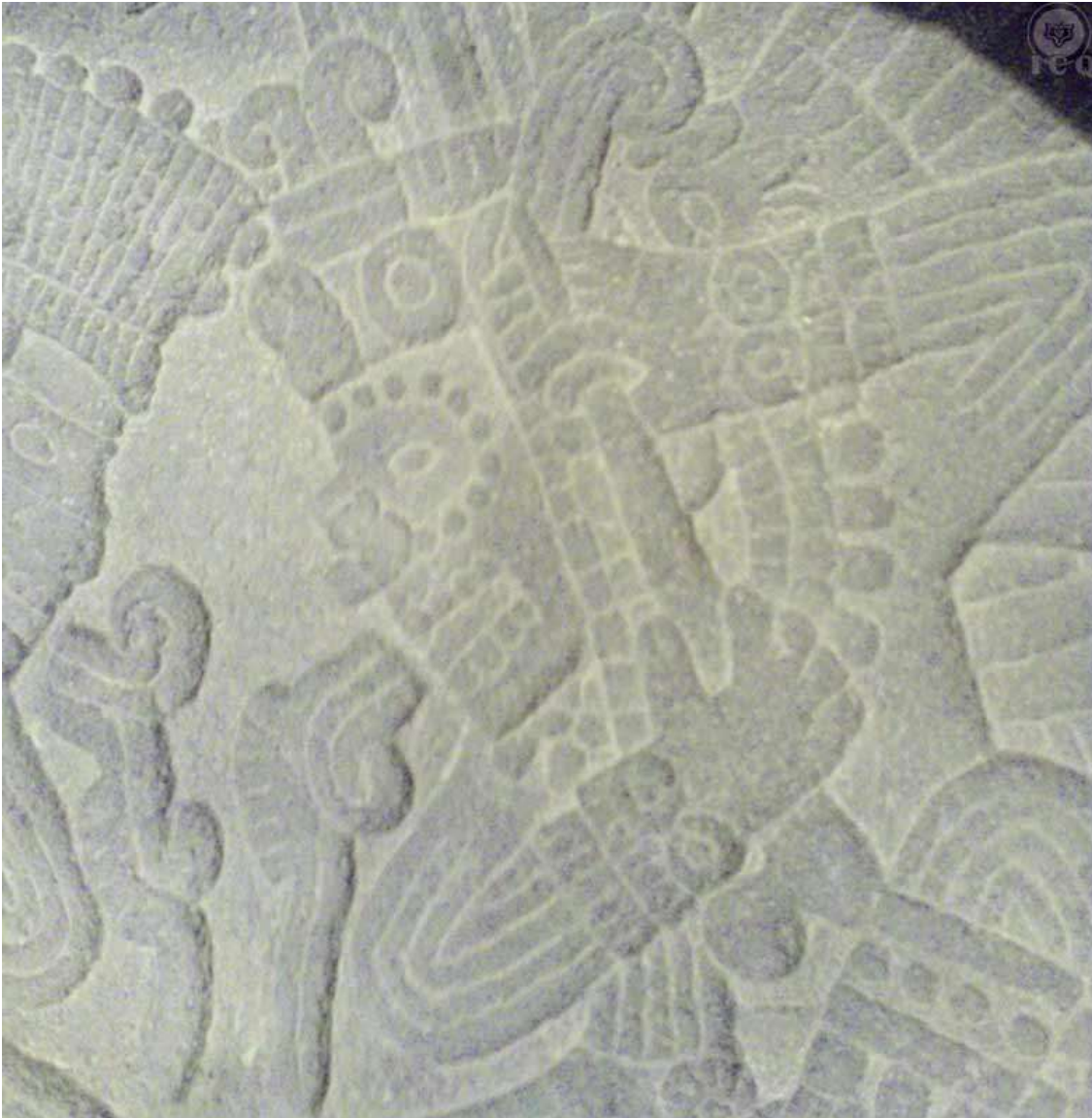
Figure 36 - A scene of self-sacrifice where an ear is pierced; detail from "Jaguar-Jícara de Aguilas". *Museum of History and Anthropology)

There are many other carvings and engravings that show others piercing their ears, as a reminder that we must transform the words of hatred, criticism and insults we hear instead of reacting with anger; we must learn to sacrifice our negative sentiments into comprehension and love for others. These efforts comprise the system of the Transformation of Impressions, where the practitioner uses his consciousness as a filter before the impressions can reach their mind.