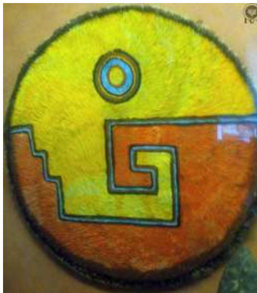
Figure 8 - Shield of Feathers (Museum of History and Anthropology, Mexico)

The teachable point is that we must make an effort to stop complaining of all that happens to us and instead, make the effort to make the most out of the adversities we face. Each adversity hands us an opportunity to discover our psychological defects and any defect that is