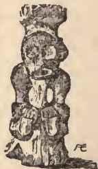
IMAGE FOUND AT SANTO DOMINGO.

"The illustrations are particularly well chosen and neatly executed, and they add to the general excellence of the volume."— New York Times .