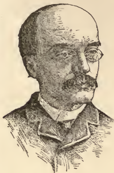
JOHN BACH MCMASTER.

H ISTORY OF THE PEOPLE OF THE UNITED STATES, from the Revolution to the Civil War. By JOHN BACH MCMASTER. To be completed in five volumes. Vols. I, II, and III now ready. 8vo, cloth, gilt top, $2.50 each.