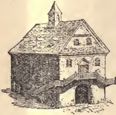
COLONIAL COURT-HOUSE, PHILADELPHIA, 1707.

"This work marks an epoch in the history-writing of this country."— St. Louis Post-Dispatch .