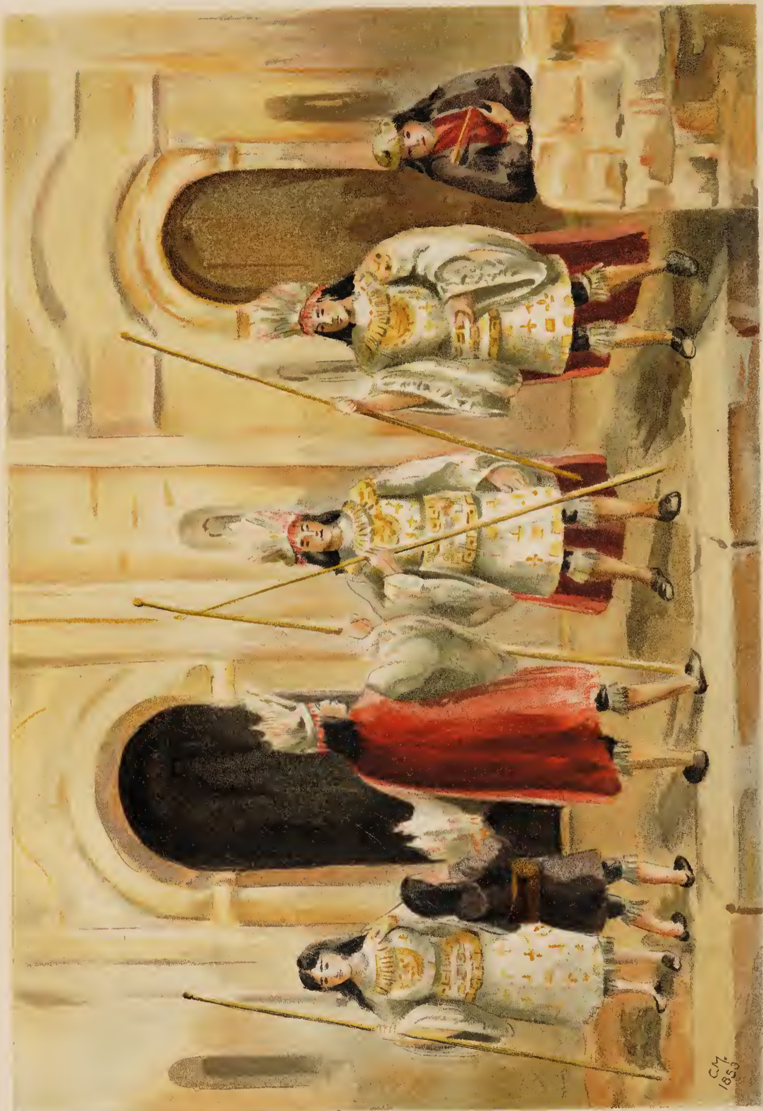
GROUP OF INCAS, in ceremonial dresses, from the pictures in the Church of Santa Ana, Cuzco, A.D. 1570.

From a sketch by Sir Clements Markham, 1853.