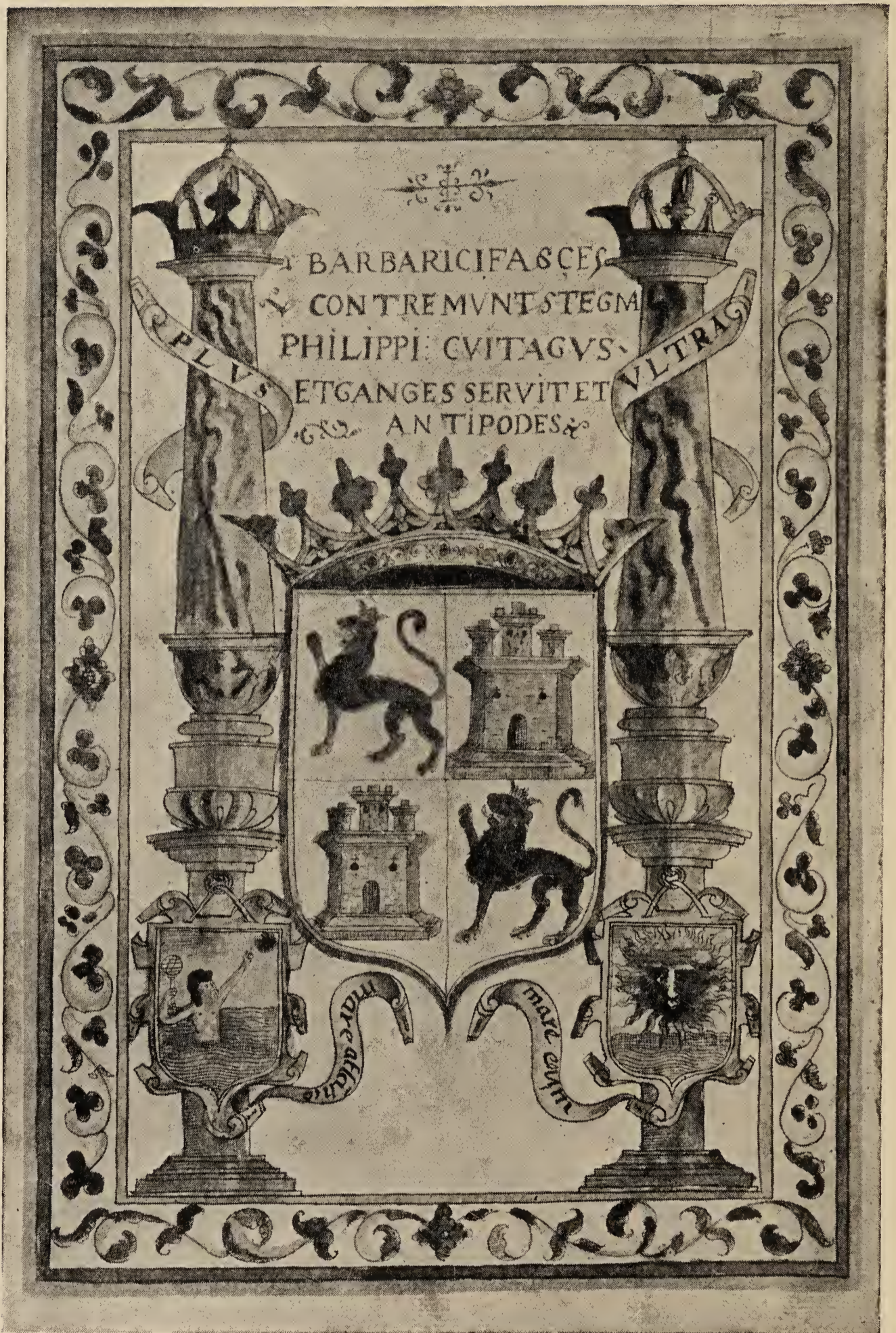
Facsimile (reduced) of PAGE I OF THE SARMIENTO MS. 1572.

From the original, Göttingen University Library.