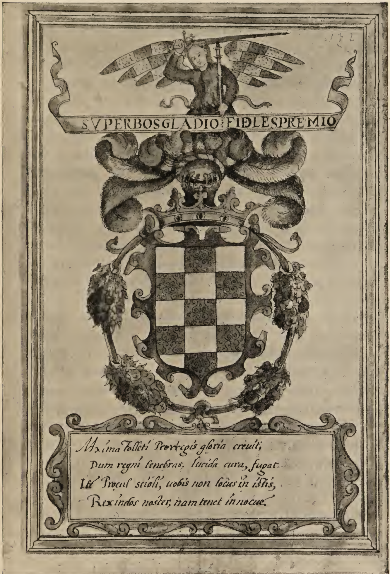
Facsimile (reduced) of the COAT OF ARMS OF DON FRANCISCO DE TOLEDO, VICEROY OF PERU, 1569—1581.

From the Sarmiento MS. 1572, Göttingen University Library.