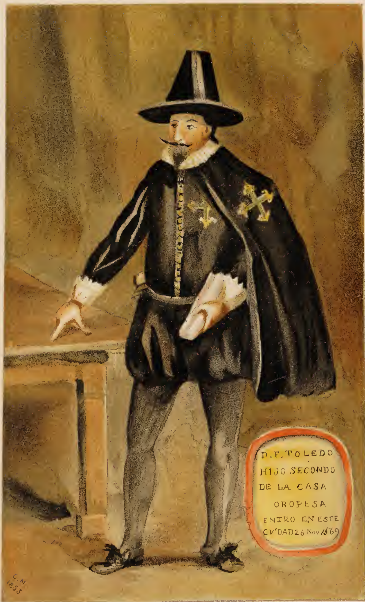
DON FRANCISCO DE TOLEDO, Viceroy of Peru, A.D. 1569—1581:

After the portrait at Lima, from a sketch by Sir Clements Markham, 1853.